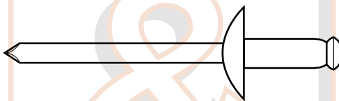
PART NUMBER COMPARISON - LARGE FLANGE ALUMINUM RIVET/ALUMINUM MANDREL